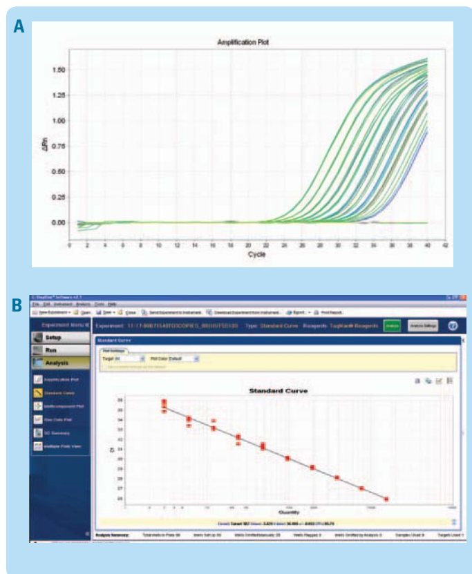
Figures 1A & 1B Low Copy Discrimination

Amplification plot and standard curve plot for 2-fold dilution of linearized plasmid run on a StepOnePlus real-time PCR system. Brilliant III Ultra-Fast QPCR master mix exhibits precise detection of 2-fold differences from 1536 copies down to 3 copy equivalents. The novel hot start technology of Brilliant III Ultra-Fast QPCR reagents decreases primer-dimer formation and amplification of unwanted side reactions resulting in superior sensitivity of detection down to very low target concentrations. Efficiency = 95.7%, RSq = 0.992.